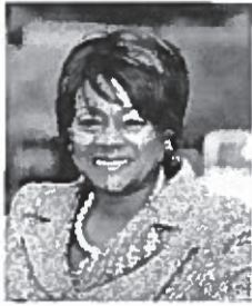
Jennette Arnold OBE AM

City Hall Queen's Walk London SE1 2AA Switchboard 020 7983 4000 Minicom: 020 7983 4458 Web: www.london.gov.uk